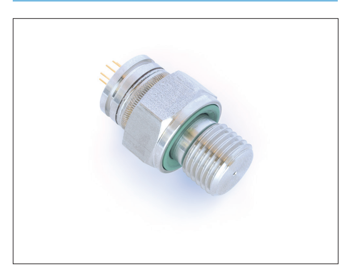
The KELLER PA-20D pressure transmitter

«The pressure sensors from KELLER have the reliability and robustness required to withstand even the harshest environmental influences. The digital I2C interface has also made it very easy for us to integrate it into our electrical design.» Mike Prior-Jones