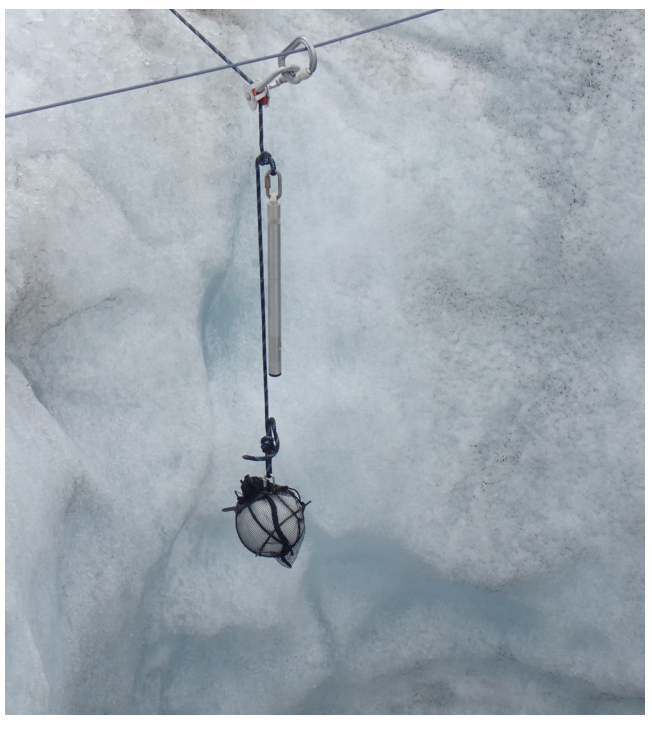
The Cryoegg is attached to a rope and lowered into the moulin